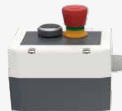
Example standard housing