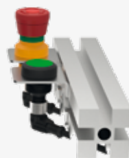
Compact command devices

No extra housing and lower wiring costs: Compared to standard screw terminal housings, Murrelektronik’s new compact push buttons significantly lower overall costs and are still tight all around!